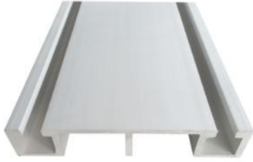
125mm CNC Table Aluminum Materials