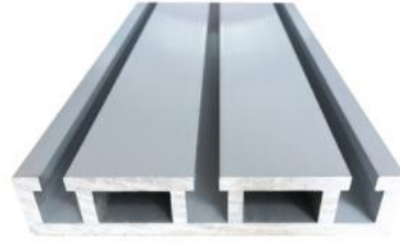
160mm CNC Table Aluminum Materials