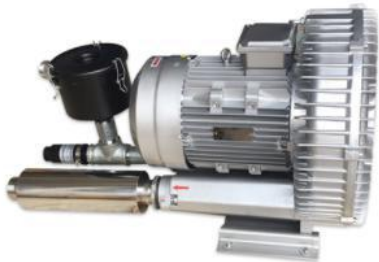
Air Cooling CNC Vacuum Pump