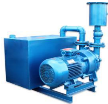
Water Cooling CNC Vacuum Pump